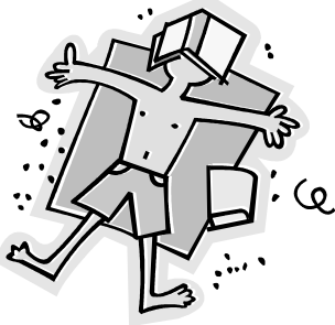
Reference, Manuals, Guide Books