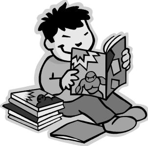
Comics, Magazines, Newspapers